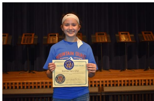
Presidential Fitness Award