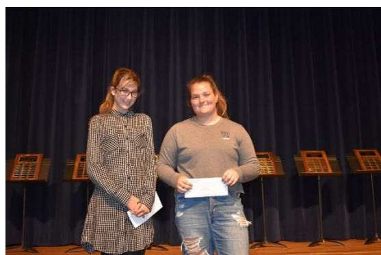
7 th Grade Perseverance Award