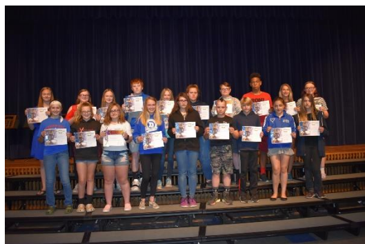
Presidential Award for Excellence

7 th -8 th Grade Awards Ceremony on June 12 th .