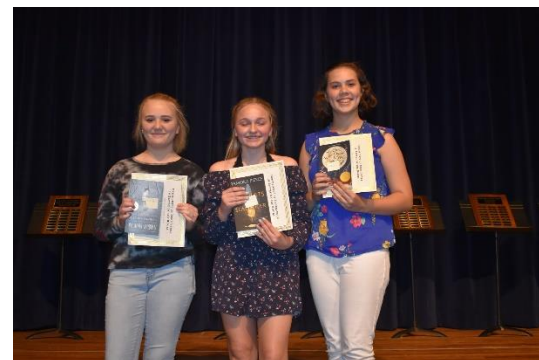
Battle of the Books