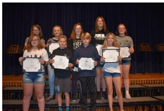
Presidential Award for Achievement